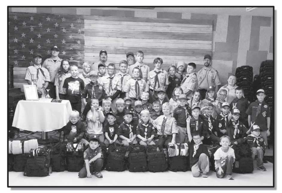
Cub Scout Pack 17 of Spearfish provided backpacks for the Veterans of Cornerstone. What a great group!

<u>MISSION:</u> Foot powder, towels, twin-sized blankets, twin-sized sheets, reading glasses, bottled water for sack lunches, personal hygiene items for men & women, backpacks.